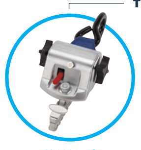
AL800855S TITAN800 with L Track Fitting