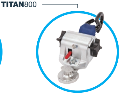
AL800944S-SNC TITAN800 with SNC Fitting