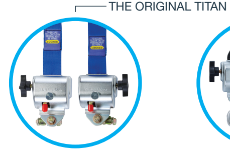
AL700907S / AL700855S AL700 TITAN with L Track Fitting